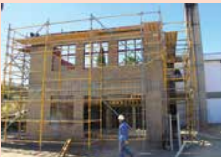
The crematorium extension to the old building

The City of Windhoek hereby informs the public that, the old crematorium repairs has been partially completed and it is now operational. It should however be noted that, the crematorium is provisionally being operated manually in order to attend to the cremation backlog dating back from January 2015.