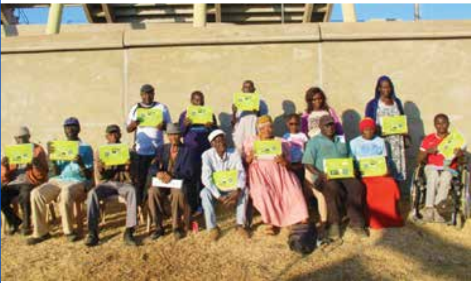
Beneficiaries of the Solar Systems donated by the Municipality of Nanjing